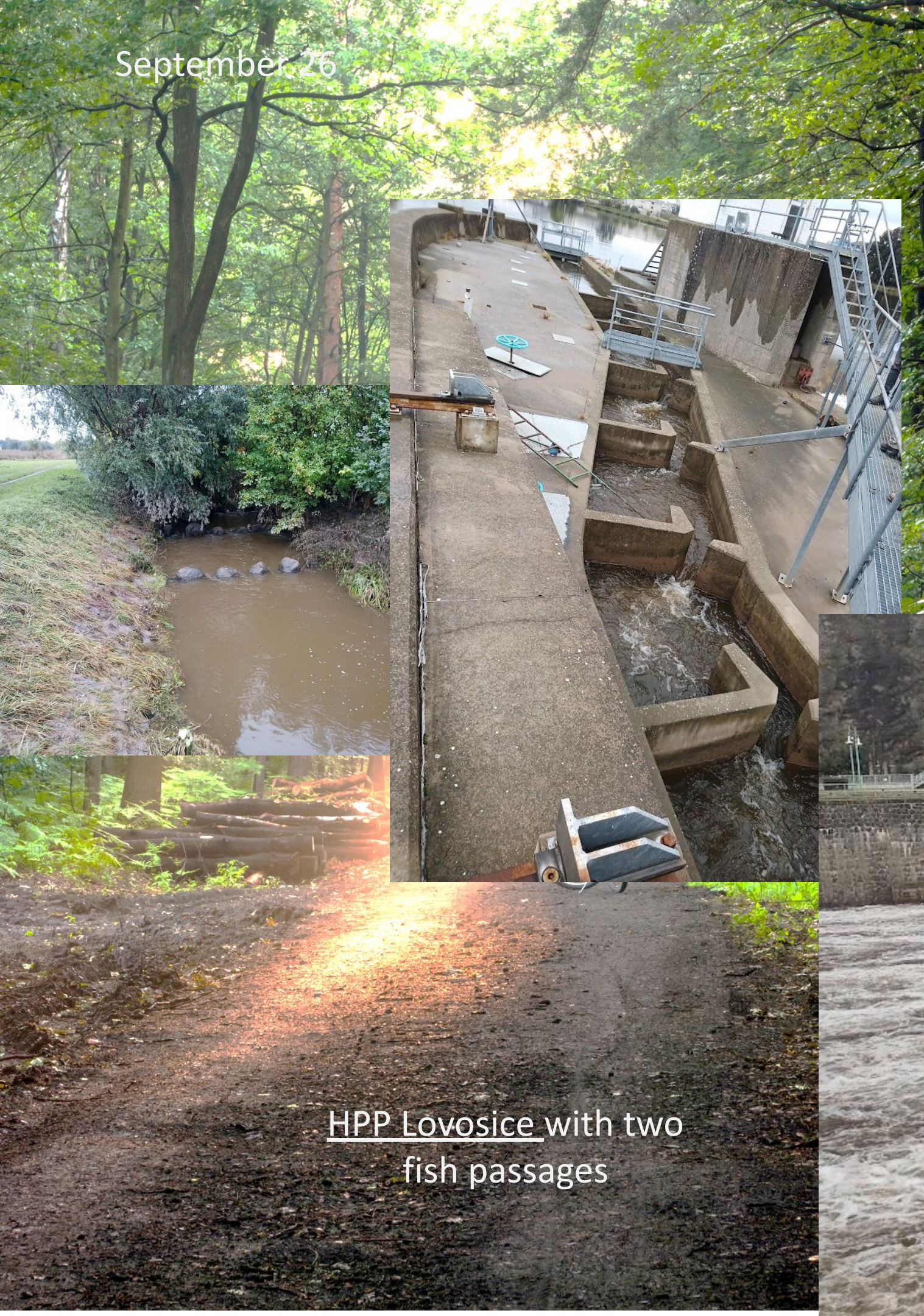
HPP Lovosice with two fish passages