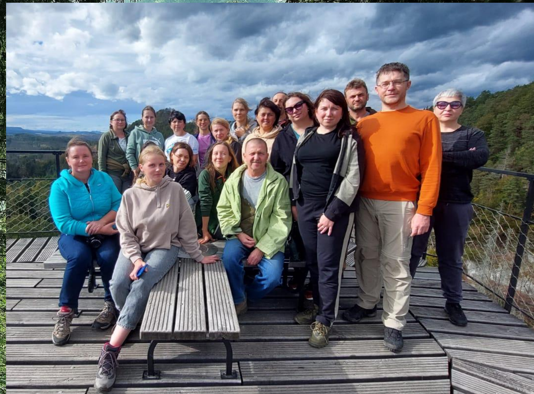
Photos from tour participants and NCA CR colleagues

Ministry of Environmental Protection Department of Nature Reserve Fund and Biodiversity was represented by 3 people, 2 people were from Regional landscape parks – Dnister and Dikansky and 1 person from National Nature Park Desna-Stara Huta. Most of the participants belonged to the stakeholder groups relevant to nature conservation in Ukraine representing senior experts on biodiversity protection, Regional Administrations, Regional Council, National Academy of Sciences, universities, nature parks, research groups and NGOs (11 people). 3 journalist from various media were present as well and will cover the experience in more than 9 articles.